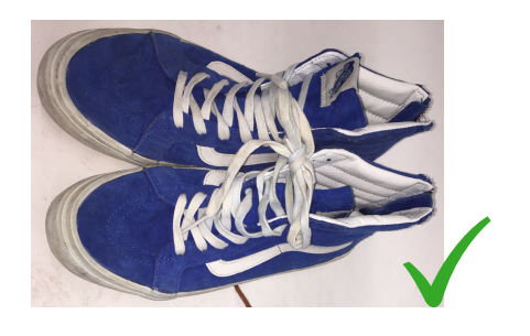
All shoes collected should be in wearable condition.