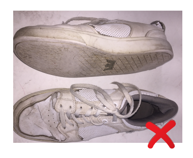
Shoes that are cracked or have worn out soles will NOT be accepted. High heels will NOT be accepted.